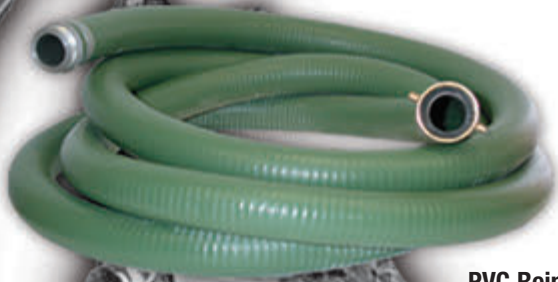
PVC Reinforced Suction Hose