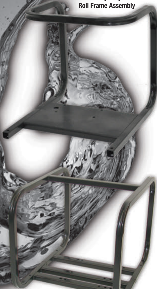
3 HP Heavy Duty Steel Roll Frame Assembly