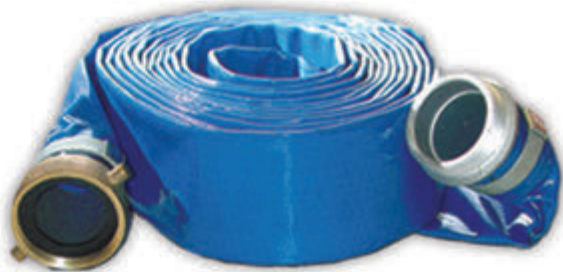
PVC Flexible Discharge Hose